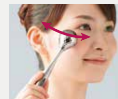
Eye Care Roll gently right and left under your delicate eyes.