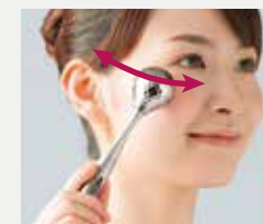
Eye Care Roll gently right and left under your delicate eyes.