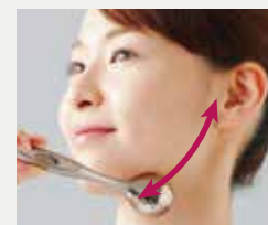
Face Line Care Roll along your jaw line from the bottom of your chin to your ear.

Roll both ways over the soft parts of your skin, along the lines of your face and décolletage.